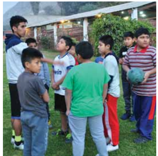
A chance to play on a flat grassy field, something most of these children have hardly ever seen previously, causing some of them to believe they were in another country!