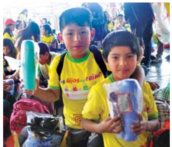
Winning those prizes and gifts at the end of the week to take home and show to the family.

Train up a child in the way (he) (she) should go; and when he/she is older, they will not depart from it. Proverbs 22:6