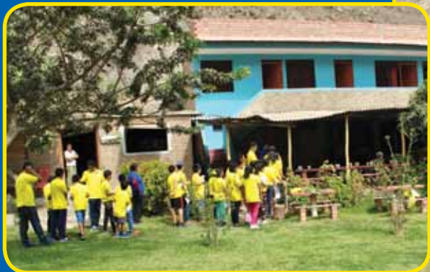
Onsite there was a large centre building where meals could be enjoyed as well as plenty of space for indoor activities to be enjoyed in the evenings.