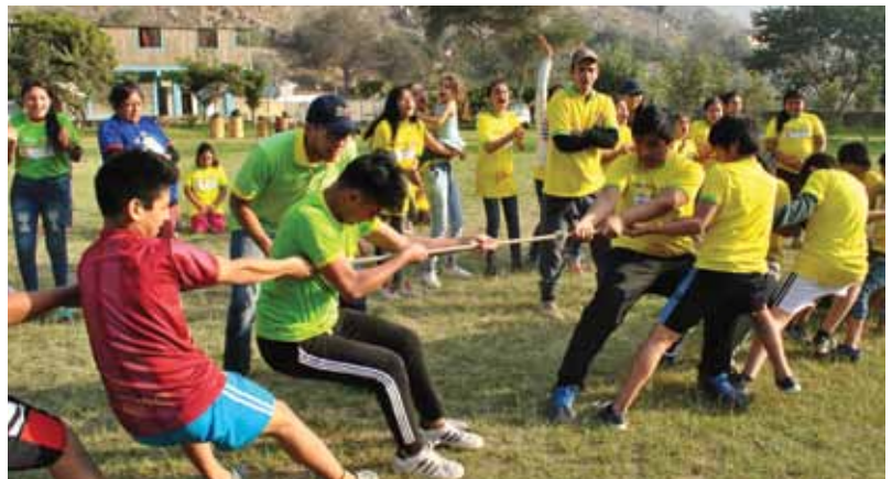
Physical times as well like this tug of war but let us not forget the spiritual tug of war that goes on in the unseen world for the souls of our young people, which we are called to confront.

I know of no more profitable way you could invest with Siloam this month, than by providing a holiday in a challenging Christian atmosphere for youngsters such as these.