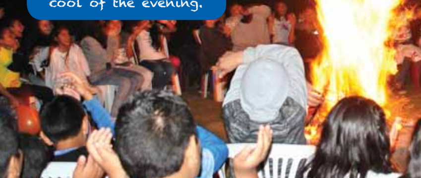
It was great to make so many children happy and to see their smiles and hear their appreciation. Only your gifts made this possible last year so I am determined we will do this again in August 2019.

No camp would be complete without a campfire on the last night. This seems to inspire singing and worship as they gather round the flames to enjoy the warmth in the cool of the evening.