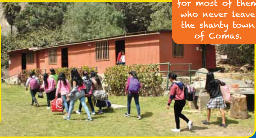
The children were accommodated in comfortable cabins with twin beds and adequate washing facilities where they would be looked after for 5 days.