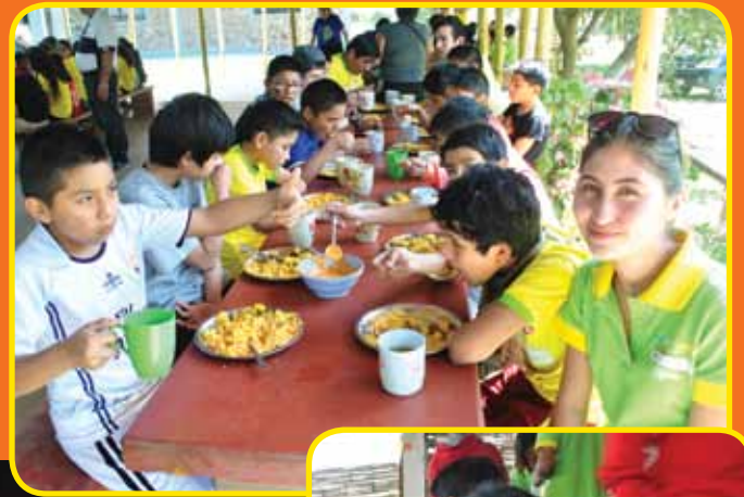
One of our team leaders (on the right) supervises the mealtime after a long day of enjoyment.

No camp would be complete without a campfire on the last night. This seems to inspire singing and worship as they gather round the flames to enjoy the warmth in the cool of the evening.