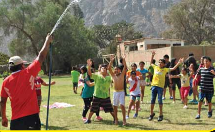
Cooling off in the heat making use of the available water was something these children could never do back home.