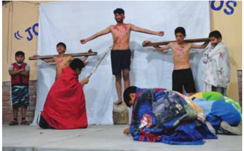
Taking part in biblical drama has a powerful effect on the minds of youngsters who come to realise why Jesus loves us so much, enough in fact to die for us.

Yours sincerely on behalf of those your love will touch this month in Peru