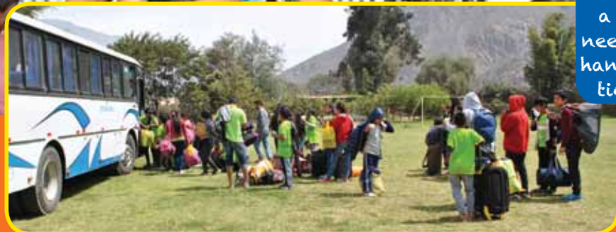
The time was all too short and sadly the children had to return to their humble homes on the 5th day. But, it was a great holiday and we know that many children were blessed and challenged spiritually which is why 27 made a confessional faith in Jesus Christ.