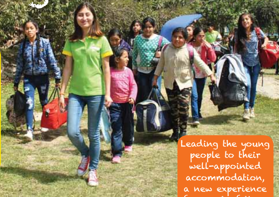
Leading the young people to their well-appointed accommodation, a new experience for most of them who never leave the shanty town of Comas.