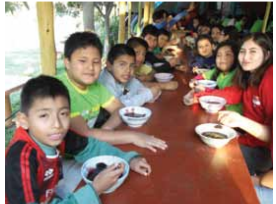
3 good meals a day provide the energy necessary not just for physical activities but also for absorbing God's Word.

Just think of it, for less than £40 our co-workers can have the valuable opportunity to rescue a young soul and win them for the Kingdom of God. This is perhaps the best value for money we can offer as our Bible camps normally cost, per child far more. But, because August in Peru is winter time, we can rent the 'Nelson camp' facilities far cheaper than those that use them during the summer.