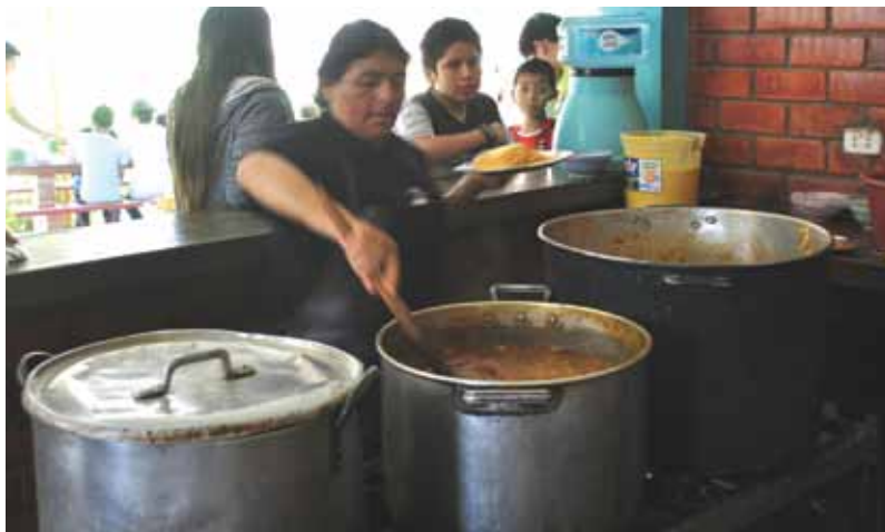
Our thanks go to the volunteers and Childcare Worldwide staff who provided the nourishing food that the children really enjoyed.