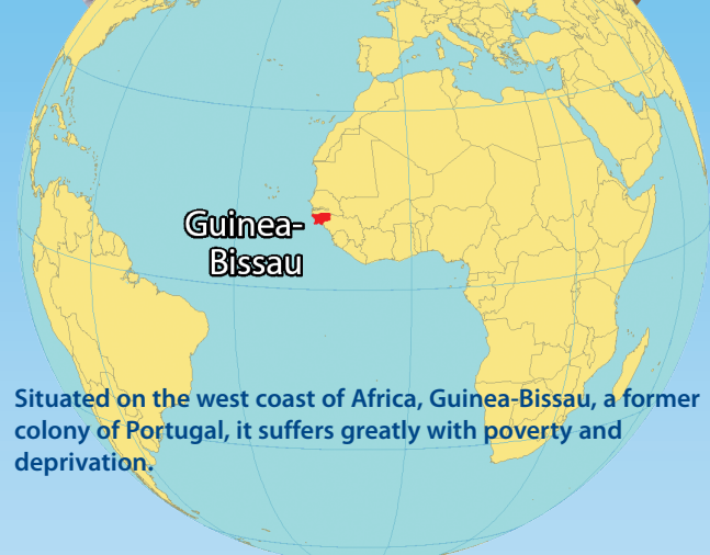
Situated on the west coast of Africa, Guinea-Bissau, a former colony of Portugal, it suffers greatly with poverty and deprivation.

Last year, €1,000 provided staple food stuffs desperately required to keep 'body and soul' together.