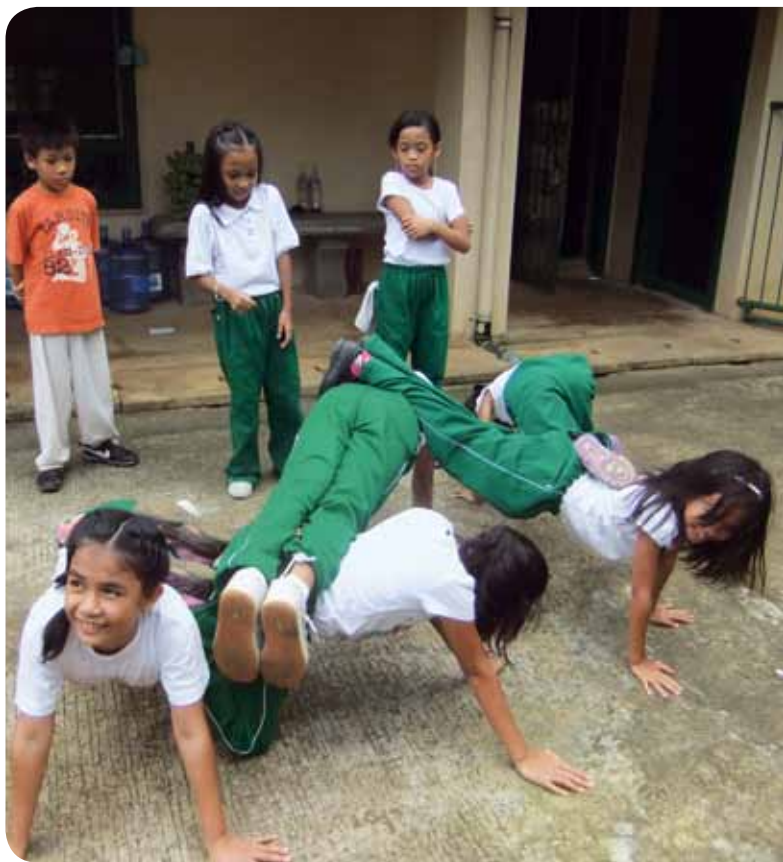
Physical fitness and fun blend well for these energetic children.

A: Definitely go! It will absolutely change your life. No amount of talking can compare with experience.