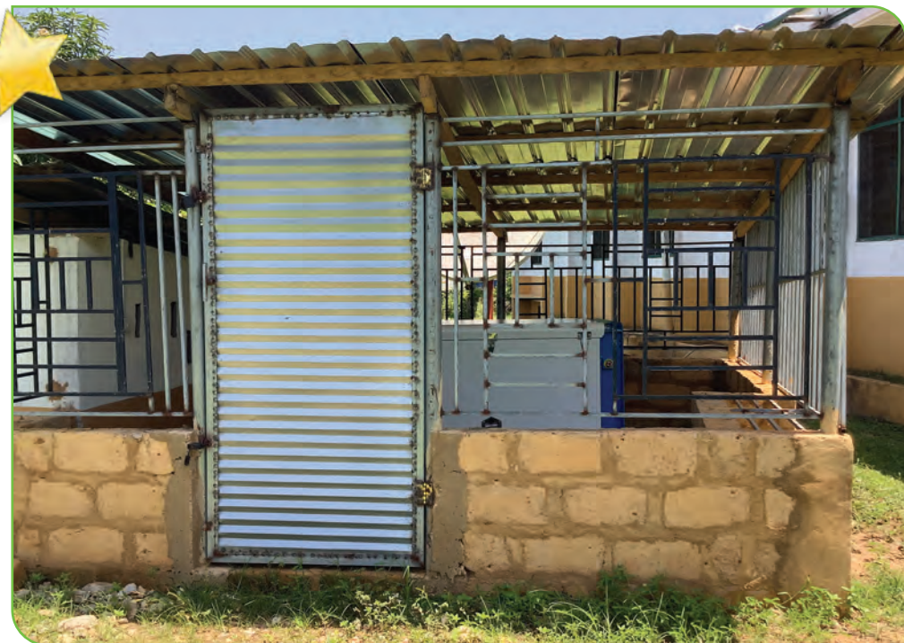
The protective cage of the Perkins KVA electric generator which enables the Siloam Gospel Clinic to operate 24 hours everyday.

With the help of Siloam supporters last year, a new 30 KVA Perkins electric generator was purchased in May 2021 with a ministry gift grant from Siloam of £9,000.